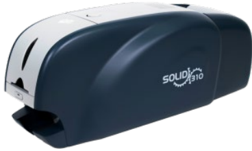
SOLID 310D & 310S