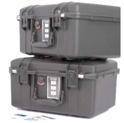
Portable Card Printer Solution