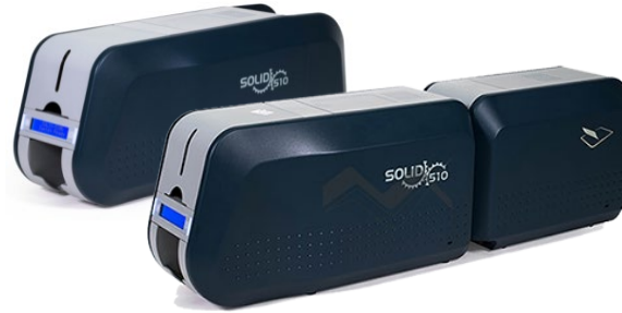
SOLID 510D & 510L